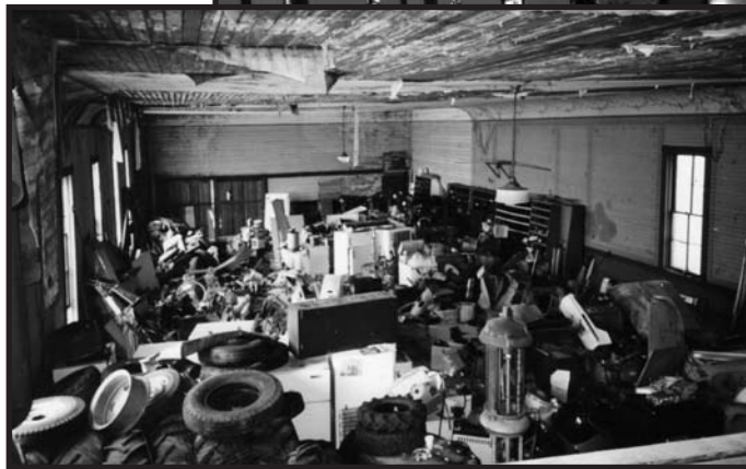
These before and after photos illustrate the extensive and costly restoration that The Floyd has undergone.