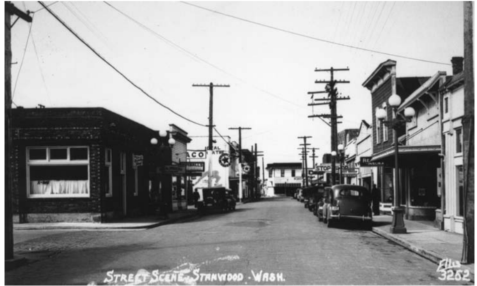
This image was taken about 1930 and on the left is the Peterson Building built in 1919 as the Citizens State Bank. They merged with new First National Bank, which can be seen down the street on the right hand side and this building became a dentist's office. These two buildings are examples of the early brick buildings and are still standing today.