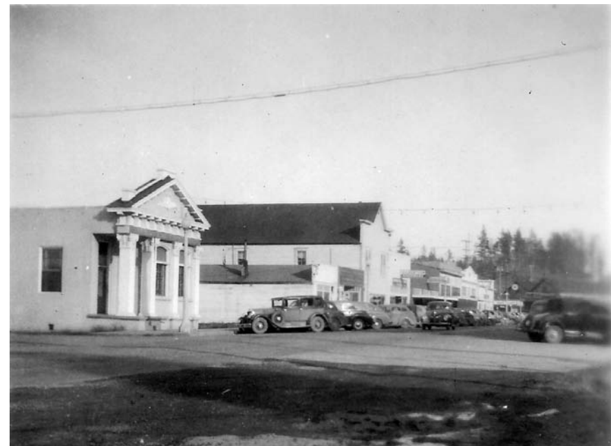
Street view of East Stanwood looking east towards the north side of the 271st Ave showing the First National Bank of East Stanwood’s first building. SAHS 94.02.03