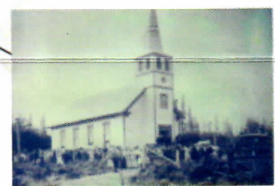
#1 Camano Lutheran Church 1904 850 Heichel Road Open Sunday & check at office