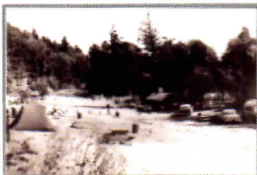
#6 Camano Island State Park 1949 2269 Lowell Point Rd Open daily dawn to dusk