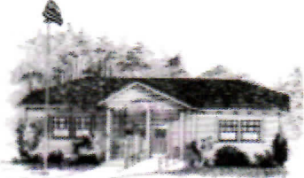
#11 Utsalady Ladies Aid 1908 79 Utsalady Rd Open for special events