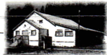
#4 South Camano Grange 1930 2227 South Camano Dr. Open for special events