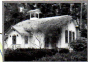
#5 Mabana Schoolhouse 1916 3648 South Camano Dr. Privately Owned Open for special events