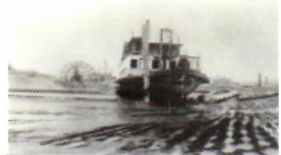
#12 English Boom, E.C. English steam tug abandoned 1945 North end of Moore Rd.

Camano is located 7 miles off I-5, Exit 212, at the west end of SR 532