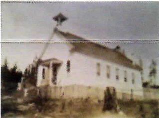
#9 Camano City Schoolhouse 1906 993 Orchid Road Open for special events