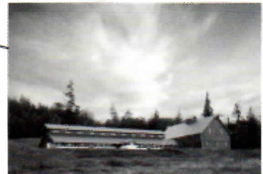
#3 Kristoferson Farm 1912 332 North East Camano Dr. Open daily