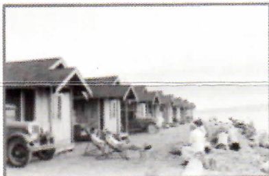
#7 Cama Beach Historical State Park 1934 1880 South West Camano Drive Open daily dawn to dusk