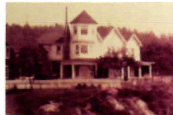
#8 Camano Island Inn 1923 1054 South West Camano Drive Open daily