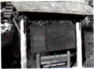
#10 Utsalady Vista Point 398 Shore Dr. Day use park