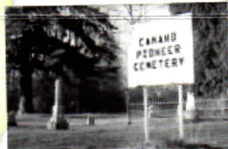
#2 Pioneer Cemetery 557 East North Camano Dr.